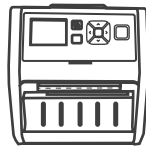
FILL LABEL PRINTER